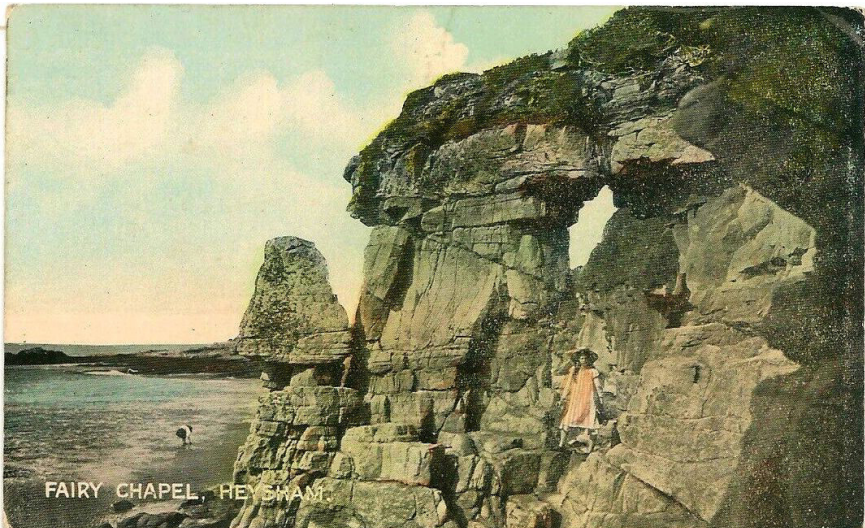
Figure 4: Fairy Bridge and Fairy Window (Heysham postcard 1912).

greeting the fairies before travelling through or across the bridge, a means of practicing taboo. The Fairy Bridge at Heysham was an attractive sea stack (see Figure 4), but of course clambering around it would have had an element of danger also. There is a similar feature known as the 'Fairy Stone' across the Bay at Humphrey Head which consists of an erratic boulder perched at an angle on the cliff face, this is also associated with a Fairy Window and was probably named by local fisherman travelling around the Bay.