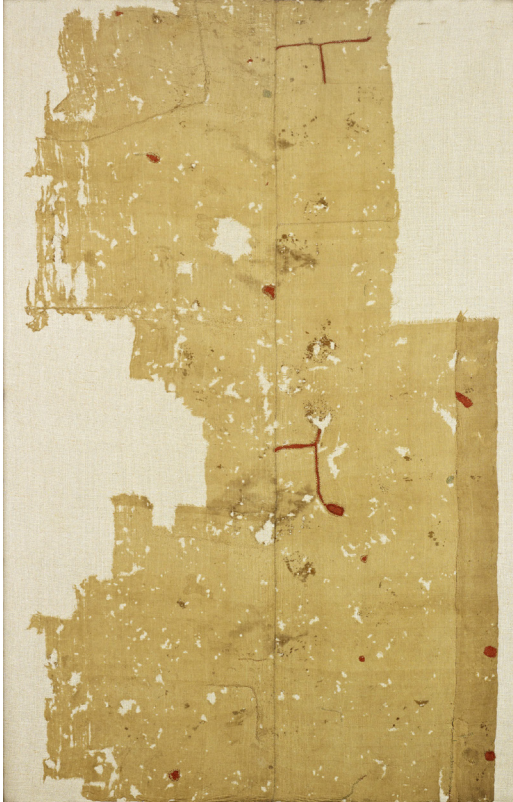
The remains of the Fairy Flag of Clan Macleod.

waved a third time, and even a fairy might scarcely touch it without tearing it' (MacCulloch 76).