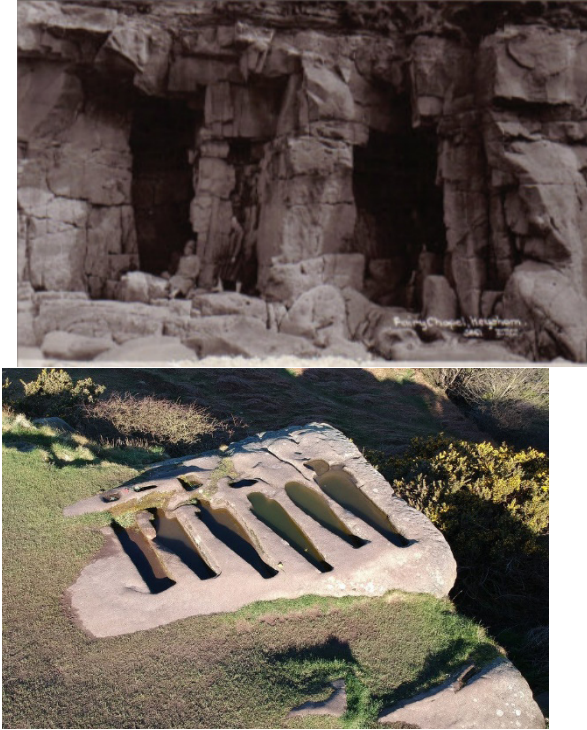
Figure 3: Comparing the shapes of the niches at Fairy Chapel with the shape of the rock cut graves associated with St Patrick's Chapel, Heysham.