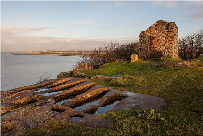
Figure 1: St Patrick's Chapel and rock cut graves, Heysham.