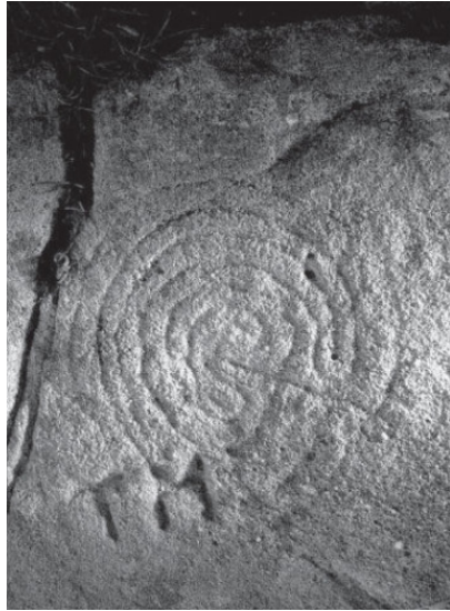
Figure 5: Heysham Labyrinth