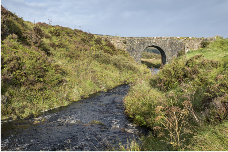
Fairy Bridge, near Dunvegan, Isle of Skye.